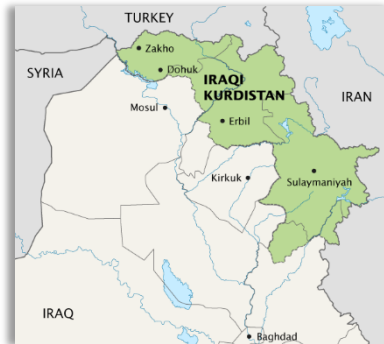
Figure 1. Federal Iraqi's Kurdistan

instability in the region. It is on under-developing stage and having potential to become the strong economy in the near future of Middle East region. Therefore, it becomes important to study the economy of the region in view of its future economy potential.